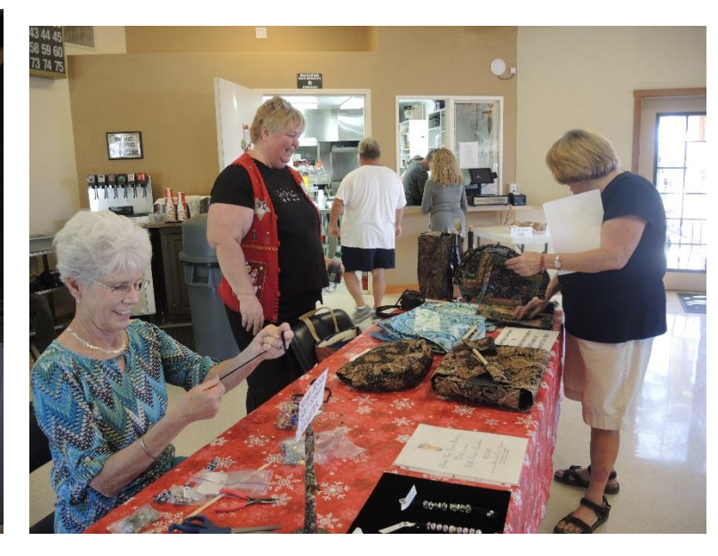
Arts / Craft Fair - Saturday, February 10 th

a night filled with entertainment and fun