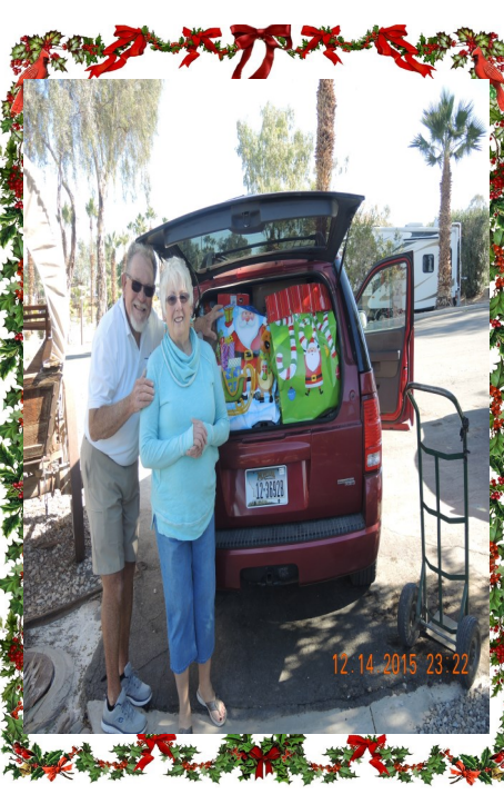
Toys for the children of Niland Elementary School