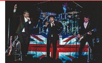
"British Invasion" Saturday, February 06, 2016 -- 7 PM

We all know the Beatles changed the game when it comes to rock and roll -- but let's not forget all the other great bands who swept onto our shores from across the pond! There was a shift in the musical culture in the mid-1960's when mop-topped rockers from across the Atlantic began to rule the airwaves. Saluting hit-makers such as Herman's Hermits, The Animals, The Rolling Stones, the Dave Clark Five and many more -- this is one invasion you won't want to resist!