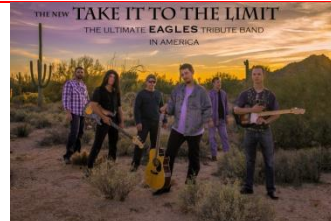
"The New Take it to the Limit a Tribute to the Eagles" Saturday, January 30, 2016 -- 7 PM

The New Take It To The Limit completely captures all of the excitement and authenticity of a live Eagles concert, complete with full horn section.