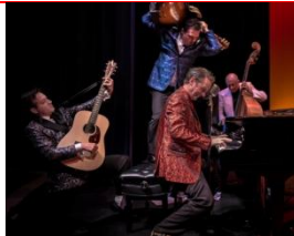
"Good Rockin' Live, A Salute to Sun Records" Saturday, January 23, 2016 -- 7 PM

In 1952, Sun Studios opened up shop in a small storefront in Memphis, TN. In a few short years, this little record company produced superstars such as Elvis Presley, Johnny Cash, Jerry Lee Lewis, Carl Perkins, Roy Orbison, and B.B. King. Good Rockin' LIVE! , with hits like "Great Balls of Fire", "Folsom Prison Blues," "That's All Right Mama," and "Blue Suede Shoes," tells the tale of how rock was born through the music and stories of those who lived it.