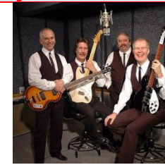
"Abbey Road Band -- A Tribute to the Beatles" Saturday, January 16, 2016 -- 7 PM

The Abbey Road Band is made up of four superlative musicians, who share the passion of those Beatles fans who witnessed that first wave of "Beatlemania" in the early sixties. The band understands the audiences who were swept up in the wave of Beatles music from the first chord on the "Ed Sullivan Show" to the last song on the album "Let it Be" and beyond. The Abbey Road Band doesn't wear Beatle wigs or period costumes, they have something far better. They were there. They lived the Beatles explosion and have dedicated their musical lives to recapture that perfect music and that perfect moment.